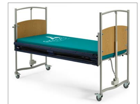
Integrated side rails - lowered