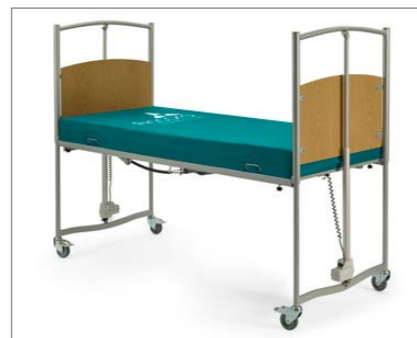
Excellent height for carers