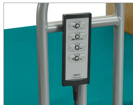
Easy to use handset