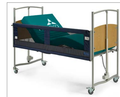
Integrated side rails - raised